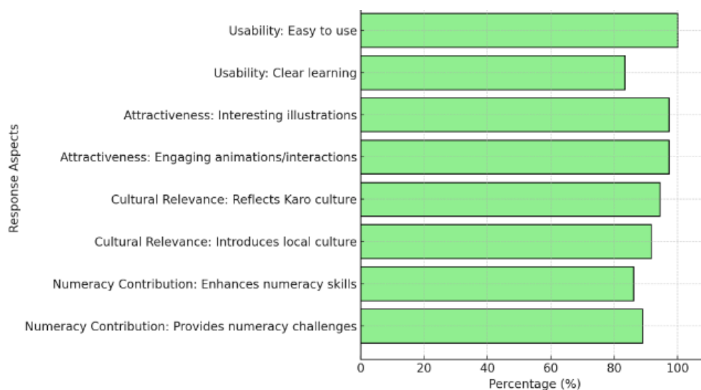
Figure 3. Student Response to Karo Culture-Based Digital Comic Media

After the four stages were completed, the answer to the problem formulation regarding the validity, practicality, and effectiveness of Karo culture-based interactive digital comics was obtained. The answer to the second problem formulation regarding the improvement of students' numeracy skills was obtained through the final stage of the Plomp method, namely the implementation of interactive digital comic media on a larger scale, namely in a class consisting of 36 students at SMA Negeri 1 Brastagi. The experimental results in this stage in one class obtained difference test data using e-views, which is shown in Figure 4 for the data normality test and Table 3 for the improvement results: