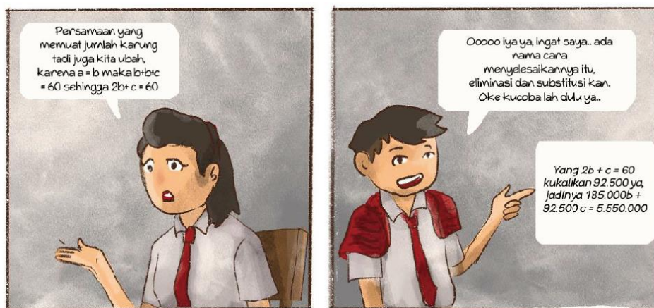
Figure 2. Comic Realized

The design phase resulted in the design of an interactive digital comic that tells the story of the success of 4 young people Karo achieved his goals. In the process of achieving success, the story tells the daily life of the youth in their home region, Karo. The comic is designed to be relevant to the topic of numeracy. There are interactive features on the comic platform, such as quizzes, simulations, and tasks that can be completed directly on the digital platform. The comics have colorful illustrations and audio in Karo and Indonesian in some scenes. The realization stage produces comics according to the previous design, as shown in Figure 2 below: